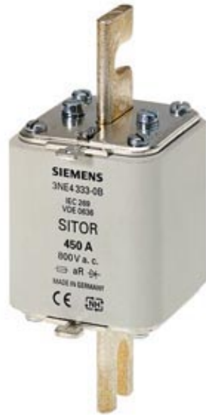
Similar to image